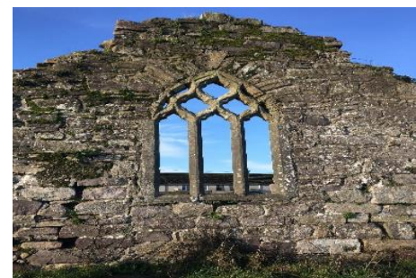
Thomple Medieval Church