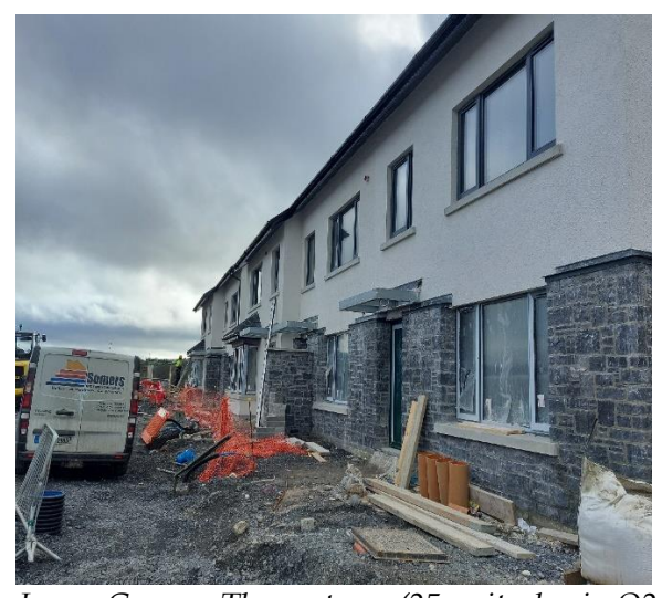
Legan Grange, Thomastown (25 units due in Q2 2023)