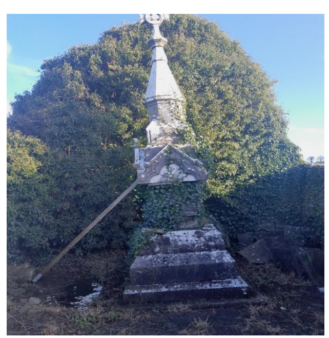
Tubrid Church and Graveyard