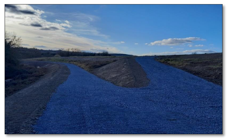
Progress Works - Kilkenny Countryside Park

Other ORIS projects progressed over the month of February included the enhancement works at the Bishopmeadows Swimming Area in the City. Works included the installation of pathways, fencing, age friendly seating and 20 bike stands. Interpretative signage will also be installed over the coming weeks.