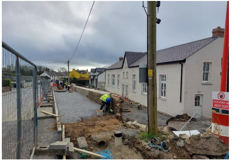
Second pic is Old Creamery, Kilmacow (9 units due in Q2 2023)