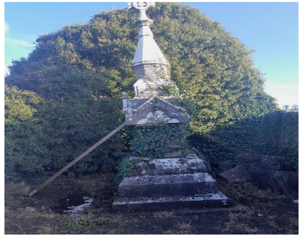
Rathpatrick Church and Graveyard with vegetation removed