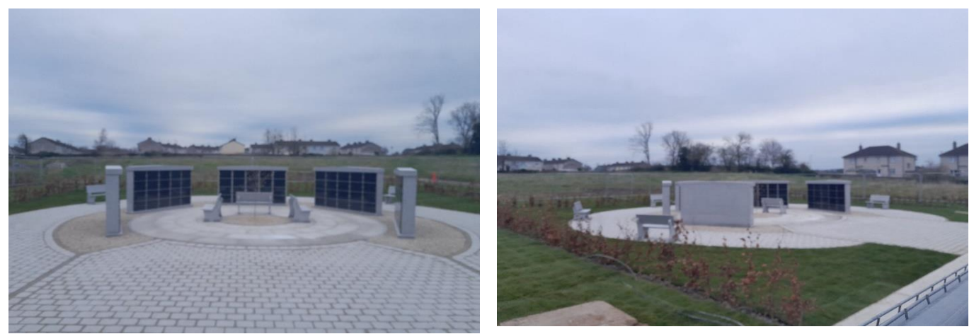
Recently constructed Columbarium Wall Garden St. Kieran's Cemetery

The construction of the Columbarium Wall and all associated site works is almost complete at St. Kieran's Cemetery. A total of 100 niches will be available within the Columbarium Wall units in the Garden, with the option to add more units subject to future demand. We are now waiting on ESB to connect up street lighting at three locations surrounding the Columbarium Wall in order to try and reduce anti-social behaviour.