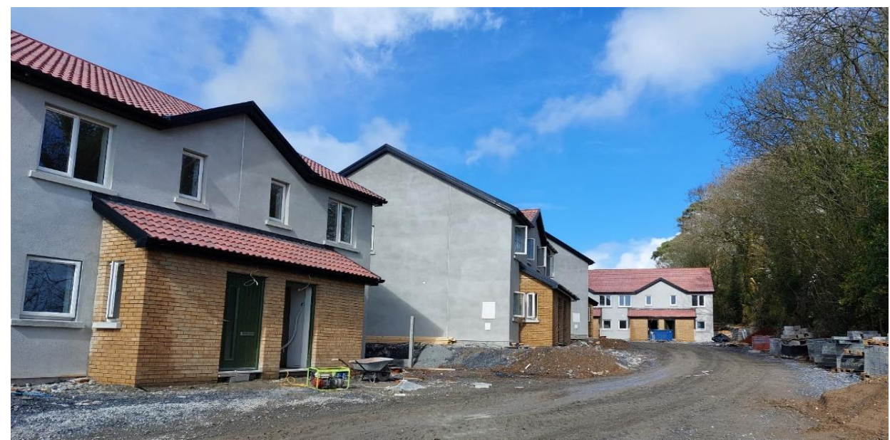
12 houses at The Crescent, Belmont, Ferrybank under Construction