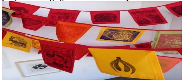
Youth Residency Programme Project

Throughout this 6-week residency the young people will engage in artmaking as well as taking a trip to Kilkenny's Butler Gallery to further enhance their experience and understanding of creative possibilities. This art programme will continue for four more weeks and will continue to explore similar themes to enable the young people to play and engage with creative practices.