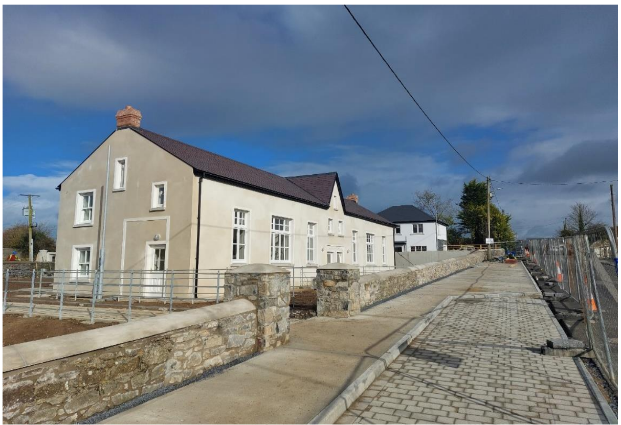
9 units at Old Creamery Kilmacow nearing completion