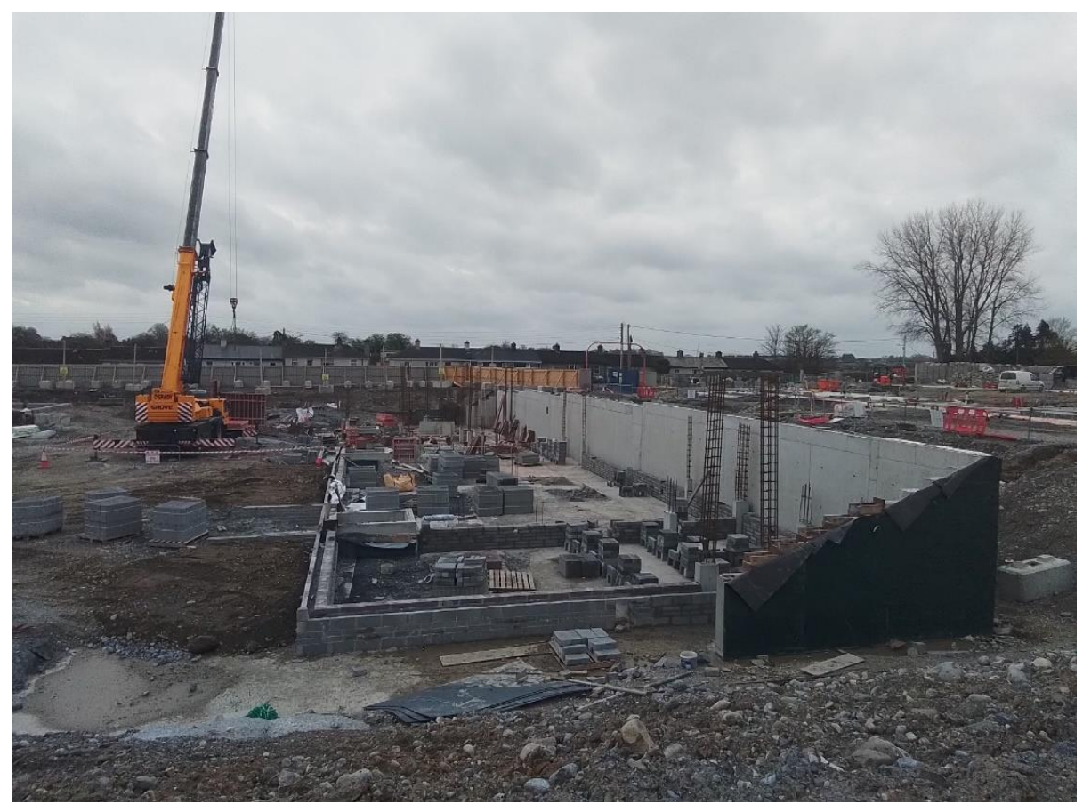
Construction at Crokers Hill, Kennyswell Road