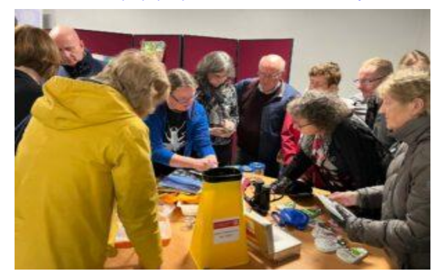
Launch of Citizen Science Kits at Loughboy Library

Kilkenny Library Services are making ecology equipment freely available for citizens looking to join the fight against biodiversity loss. The initiative, a partnership between Kilkenny County Library and the Heritage Council is designed to assist an increasingly engaged public, many of whom are eager to contribute to the preservation of our biodiversity but who lack the tools to do so. It is expected that the kits will be used by students looking to conduct their own studies, amateur ecologists wishing to produce their own biodiversity action plans and by community groups such as Tidy Towns, River Trusts and Field Clubs who want to gather information to bolster local biodiversity projects. https://www.heritagecouncil.ie/news/news-features/citizenscience-kits-to-equip-people-to-tackle-biodiversity-loss