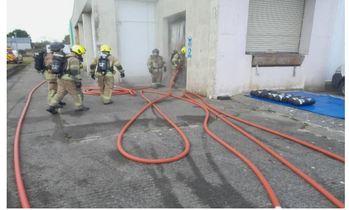
Breathing Apparatus training in Freshford

Breathing apparatus wearers undertake a twoday refresher course every two years. These courses reflect the breathing apparatus operational requirements of our Firefighters. This includes training on the safe working practices, equipment use and maintenance, set duration, operational testing to enable a firefighter to safely enter a building on fire, use of guidelines, distress signal and entry control procedures.