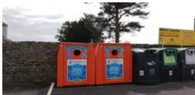
New Textile Banks in Shamrock Grove, Kilmacow, Co. Kilkenny

Kilkenny County Council has recently awarded the contract for textile recycling to Textile Recycling Limited (TRL) for the next 2 years following a tender process. The new clothes banks have been installed at all our bring centre locations in the County and operating without any issues.