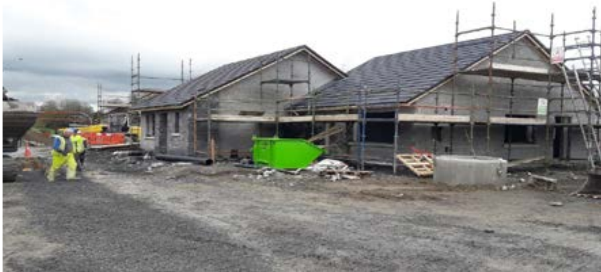
Works on Legan Grange, Thomastown ongoing