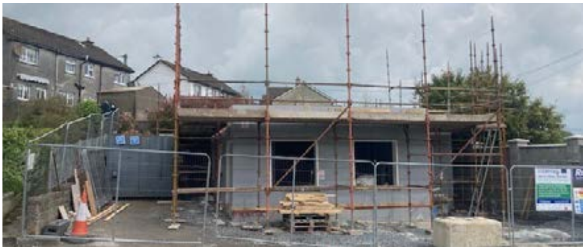
Work Progressing on 2 units in Graiguenamagh – infill scheme – ICF construction