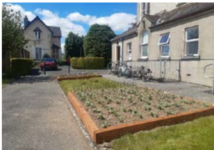
Garden beds planted by Ukrainian residents at the St John of God's Convent - Beetroots, cabbages, onion sets and lettuces have all been planted

To support the Ukrainian residents currently accommodated in the St. John of God's Convent, Kilkenny, the Parks Department assisted the Housing Section by providing some play equipment for entertaining the younger children. In addition, some raised garden beds were provided in the old convent garden for residents to grow vegetables and herbs. Permission was granted by the St John of God Sisters.