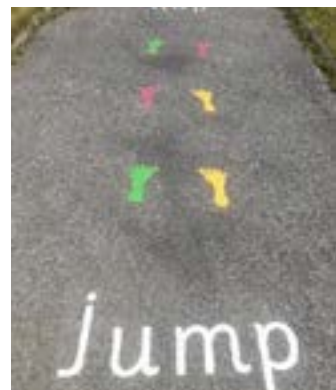
Play equipment and playground markings were provide to entertain children outdoors at the St John of God's Convent