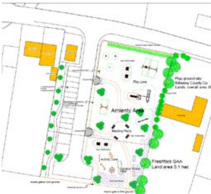
Location of Freshford Activity Hub

Tender documents are being prepared for a number of playground and amenity projects around the County. In Freshford the Parks Department are assisting the local community with the preparation of tender documents for the development of an outdoor activity hub, which includes a children's playground adjacent to the GAA pitch in the village. Funding has been approved under the Town and Village Renewal Scheme. The scheme will provide an access road, car parking spaces and outdoor activity equipment including play equipment aimed at children. The local community also intend to develop a sensory garden at the site also.