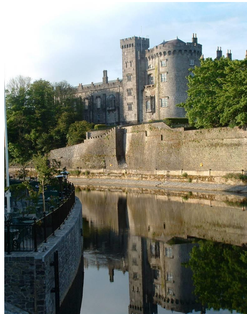
Kilkenny Castle from Johns Bridge