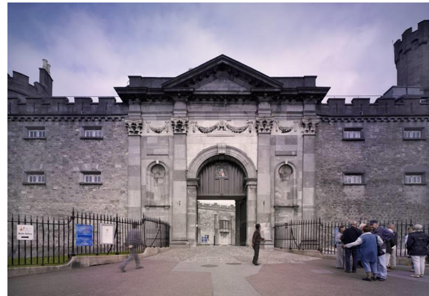
Kilkenny Castle Entrance Gate

The Council required that the framework document be neither too dogmatic nor too flexible. It would however identify certain clear principles that will be enshrined into the Kilkenny City & Environs Development Plan 2014 - 2020. The framework document will set out core design principles that should be adhered to by all developers in order to achieve the urban form that will deliver the vision for the area.